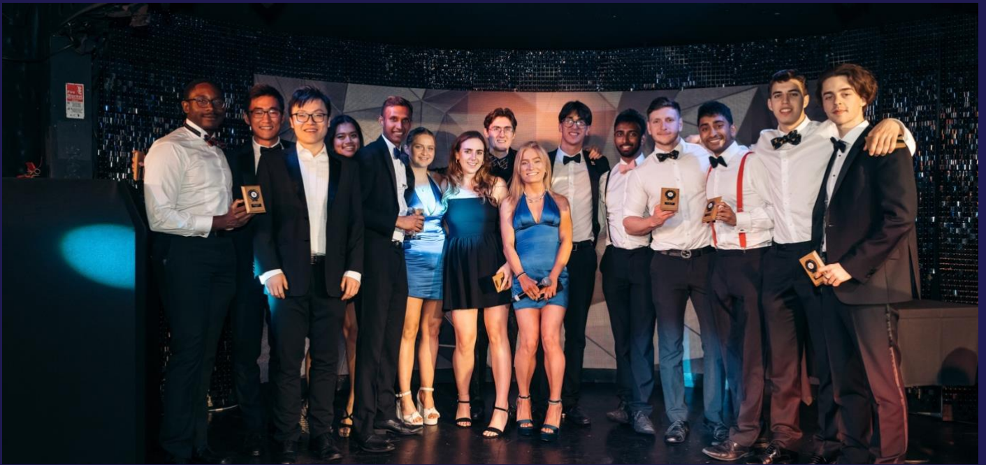
Celebrating our amazing Sports Clubs at Sports Dinner 2022