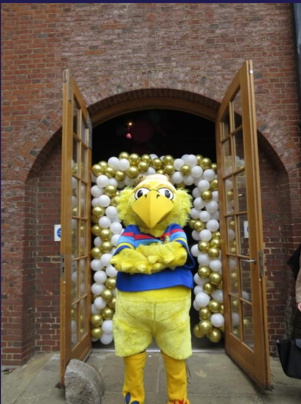
ICSMSU Doctor's Day 2022 – results day for our final years, now newly qualified doctors!