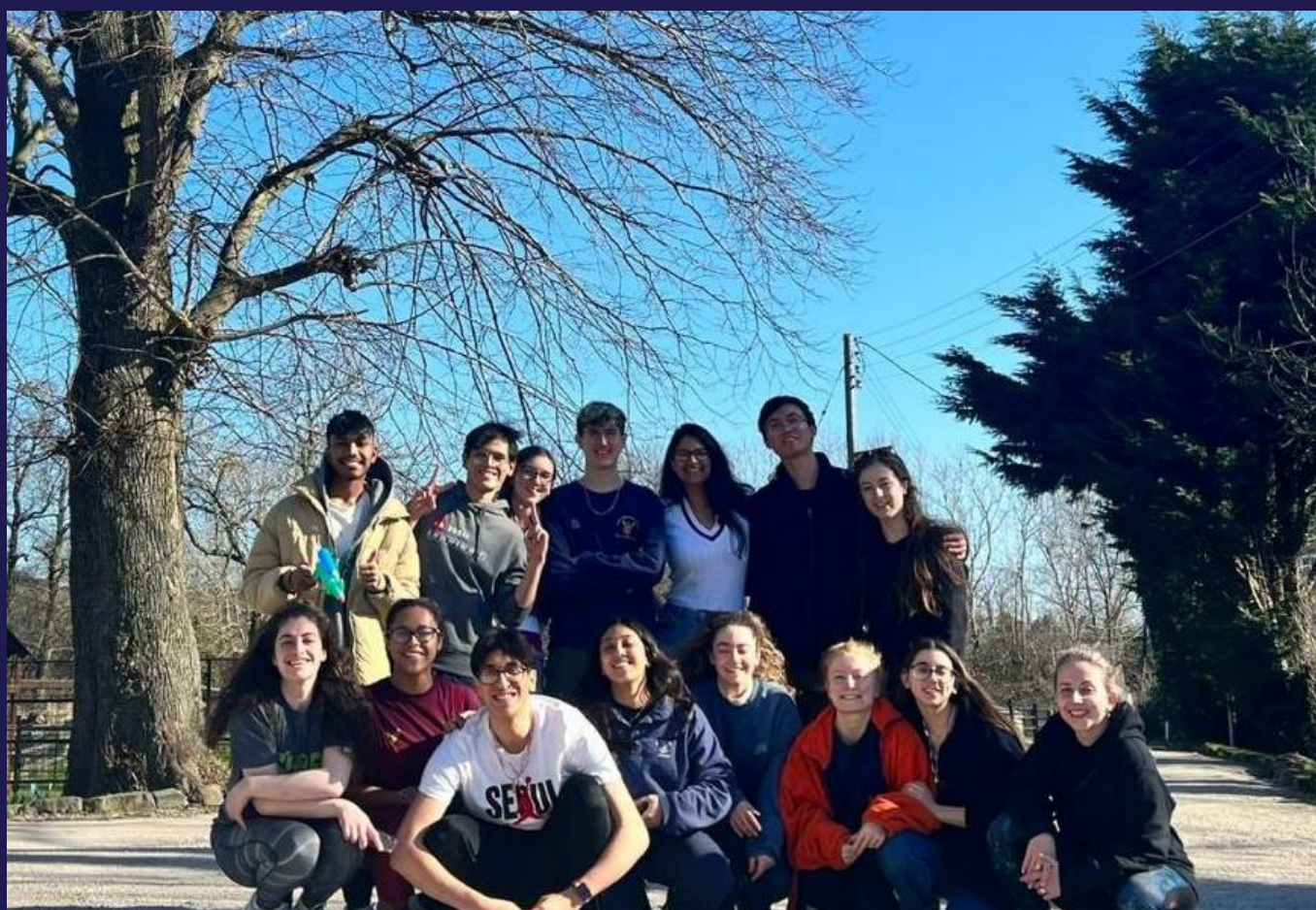
Fig 1. (Most of) Our ICSMSU committee on their SU Retreat (in Oakerthorpe Holiday Village) – there was a small farm behind the house with animals including Peacocks & Rhea, so yes, we bonded as a team through mutual adoration of cute animals

I am happy to report to council that I have been able to reflect on the past year at ICSM and feel proud of what we've accomplished. Despite some initial struggles and challenges, exacerbated by the pandemic earlier in the year, we've seen a fantastic return to in-person events and activities. We've been able to host some of our most traditional events to great success, supported our students in their studies through endless peer-peer tutorials and centralised mock exams, celebrated our clubs & societies achievements at our annual Sports & Arts Dinners and come together as a community for another amazing year at ICSM. It hasn't always been smooth sailing, these things rarely are, but thanks to my amazing committee, the amazing volunteers that power our day-day and some robust support from ICU, I can safely say that despite the persistent doom & gloom of the pandemic, we've had some amazing wins and I can only imagine ICSM going from strength to strength as next year's committee take centre stage. I wish them all the best and I know they'll make us proud, just as my committee has made me immensely proud.