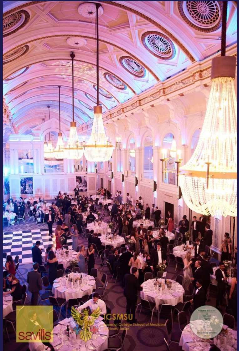
STFYD 2022 at the De Vere Grand Connaught Rooms