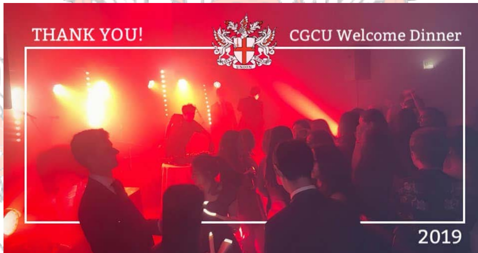
The Bands' Live performance was followed a DJ Set during the afterparty

Thanks to great publicity and an earlier ticket sales period, we managed to have over 300 attendees at the dinner (including my fellow CU Presidents, Alumni and Recent Graduates and representatives of FoE).