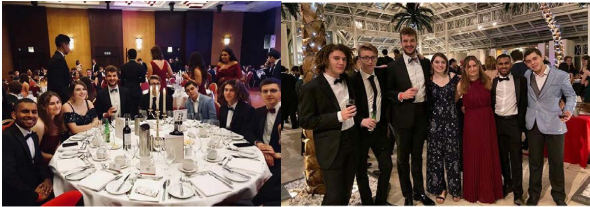
(Left) A view across the Orchard Suite at the Millennium Gloucester Hotel, where the Welcome Dinner was hosted. (Right) The reception to the dinner was in the Conservatory this year

Thanks to great publicity and an earlier ticket sales period, we managed to have over 300 attendees at the dinner (including my fellow CU Presidents, Alumni and Recent Graduates and representatives of FoE).