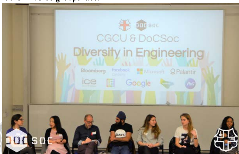
Capture from last years event, which saw the CGCU and DoCSoc combine forces

Building on our yearly Women in Engineering event which became Diversity in Engineering we have expanded this year's event to all of our DepSocs. Preparations for this event are going well with several speakers from Qualcomm, GSK and Bloomberg. Faces in Engineering will be an informal and interactive panel session with a Q&A for students, local schoolchildren and the public. We hope that these events will help introduce students to careers opportunities as well as increase their employability and their awareness everyday struggles that students from less advantaged backgrounds or those of BAEM descent and many other diverse groups face.