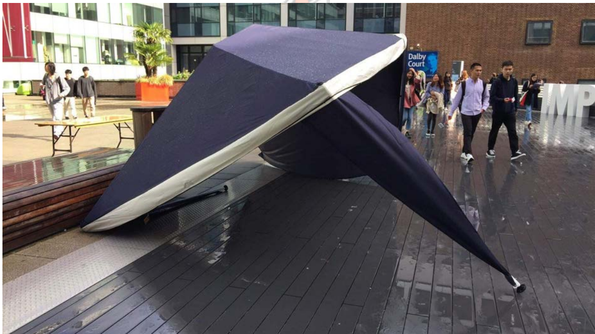
DoCSoc's Gazebo, collapsed in a deserted Dalby Court; Beside it, tables lie, Empty. #GazeboGate

The CGCU committee and CGCU Management Group attempted to have a sturdy presence at this year's freshers fair. However mismanagement on behalf of ICU Staff and inclement weather scuttled half of our clubs. Feedback from whom was collected at our first MG meeting. A proposed Freshers' Fair Policy Paper is being written to bring to the next Union Council to address these issues. Despite this the CGCU's stand fared better, being situated in main entrance. From here we gave away a great number of free condoms as well as sweets and CGCU stickers to our newest members. Overall it was a very mixed day, which has caused a great amount of division within the CGCU and a strong sense of animosity towards the Union.