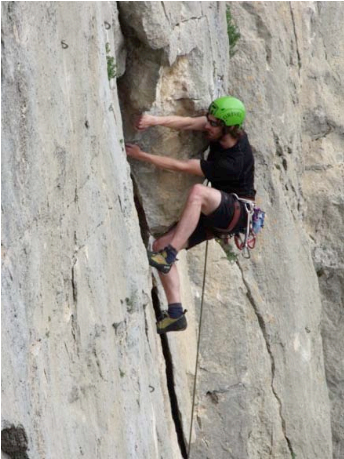
Getting to grips with it all